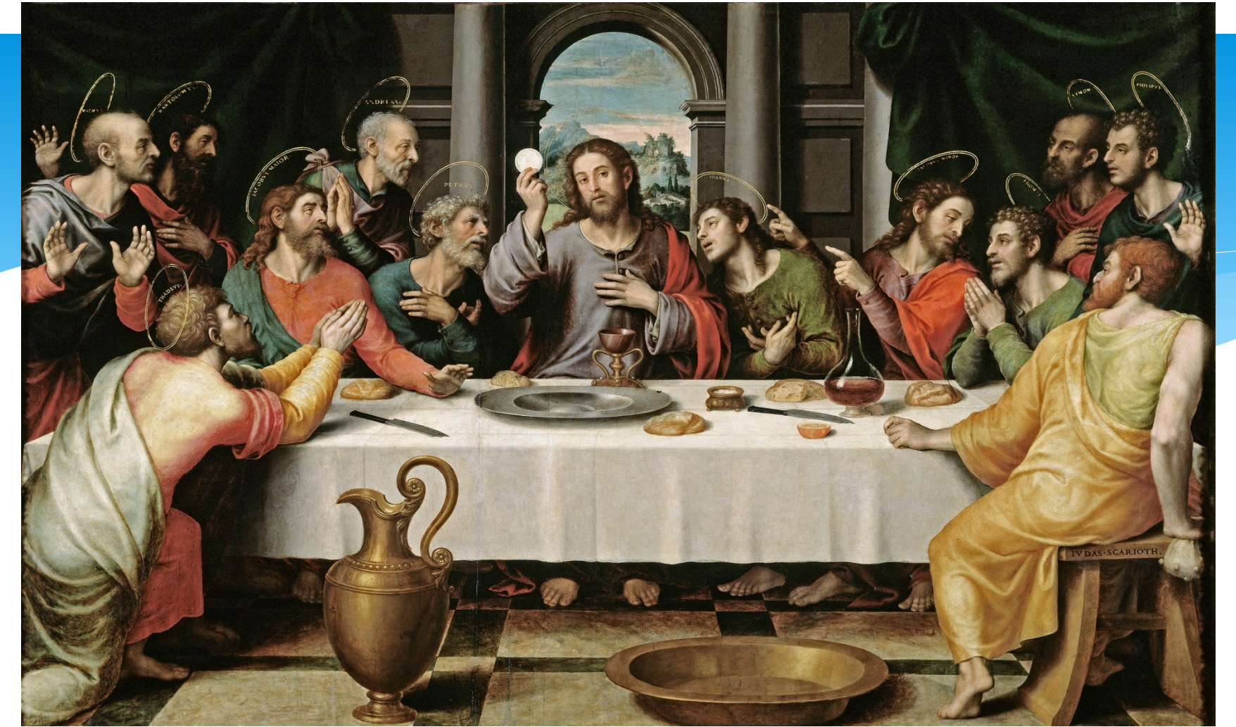
*I Corinthians 11:23 "I received from the Lord what I also passed on to you: The Lord Jesus, on the night He was betrayed, took bread,...