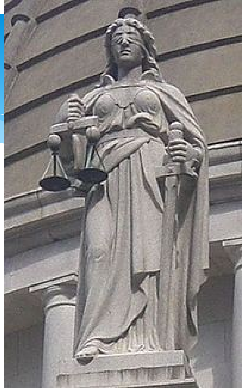
Roman: Justitia / Greek: Themis / Egyptian: Maat/Isis

✦ Our churches teach that lawful civil regulations are good works of God.