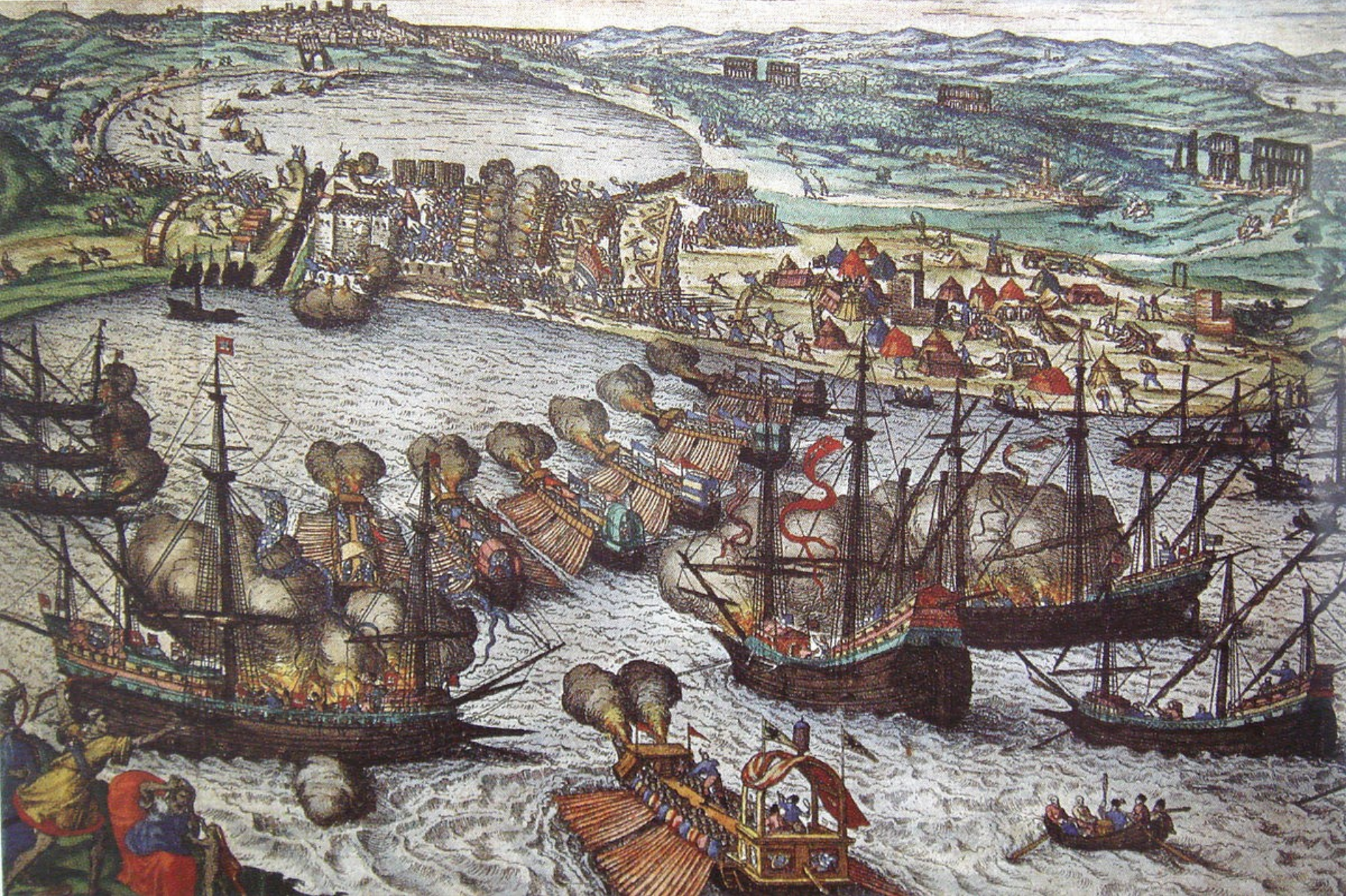
Siege and Conquest of Tunis, 1535